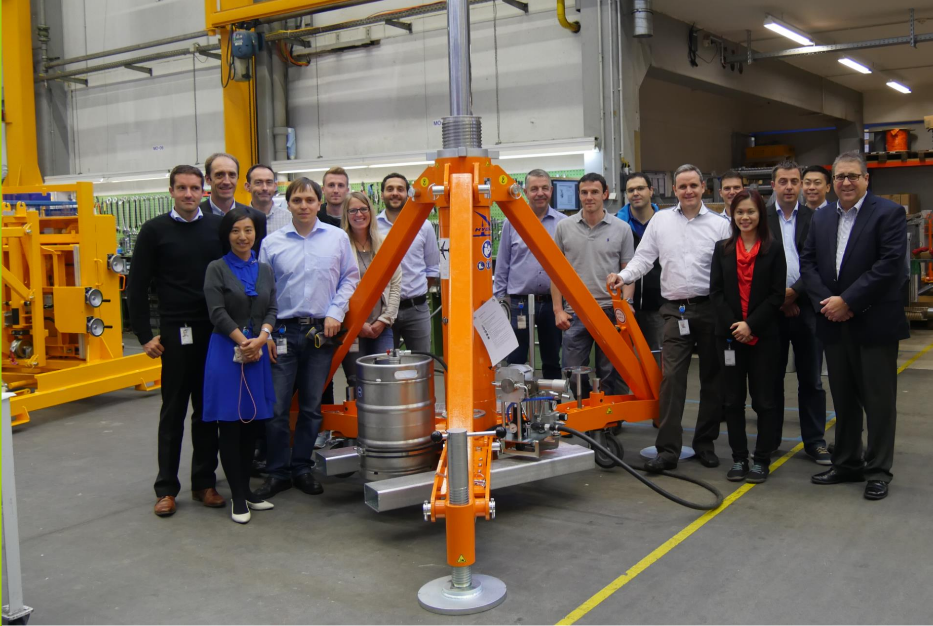
HYDRO´s international sales teams inspecting their new „baby“